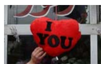
Valentine's Day marked around world