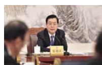
China's top legislature schedules bimonthly session