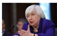
U.S. Fed to consider raising rates at coming meetings, Yellen says